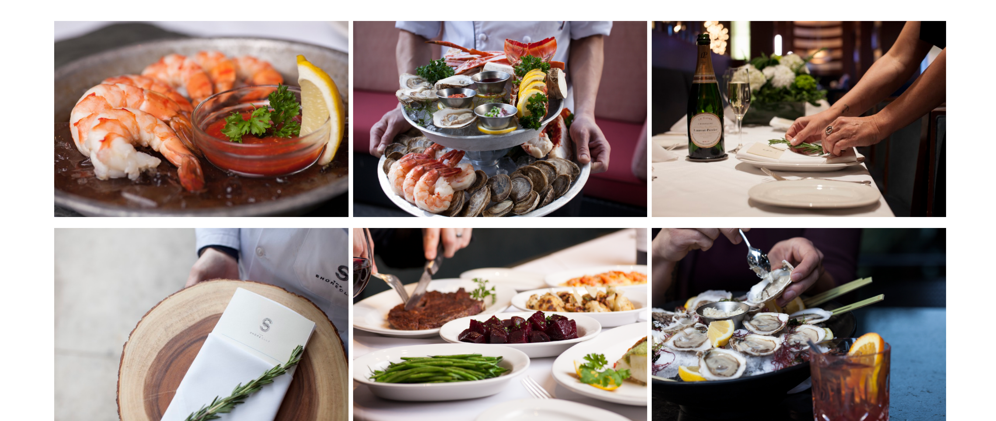
Group Events and Reception Package Spring / Summer 2025